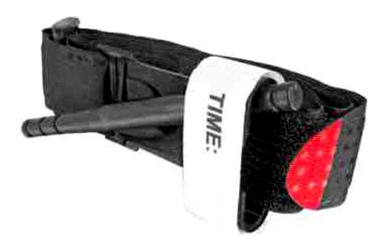
Fig. 3. Combat action tourniquet.

In our study, the 8 casualties with intra-pelvic vascular PS injuries who survived to a medical facility represent a subset in which vascular control proximal to the inguinal ligament may have improved the outcome. Future research into strategies to reduce mortality from groin vascular injury should focus on the control of bleeding that arises above the inguinal ligament, rather than from