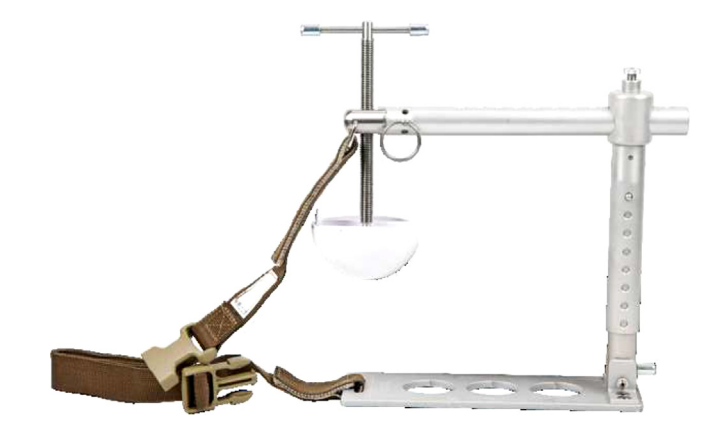
Fig. 1. Combat ready clamp.

Wounds (DOW) as that which occurs after reaching a medical treatment facility [16]. The determination of DOW or KIA status was made at presentation to the first medical facility. The determination of DOW or KIA status was made at presentation to the first medical facility.